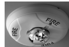
Indoor Ceiling Strobe