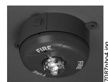
Outdoor Ceiling Strobe