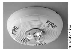
Indoor Ceiling Horn/Strobe