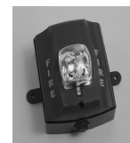
Outdoor Wall Strobe