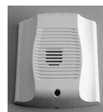
Indoor Wall Horn