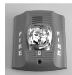
Indoor Wall Horn/Strobe